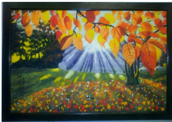
Өнгийн эсгий уран зураг: